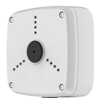
PFA122 Junction box